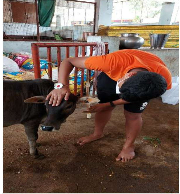
Seva at Gau Shala