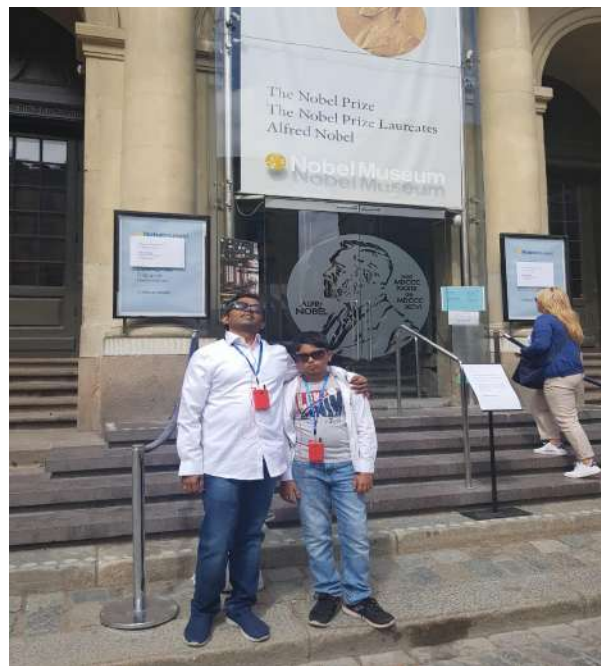
At Nobel Museum, Sweden