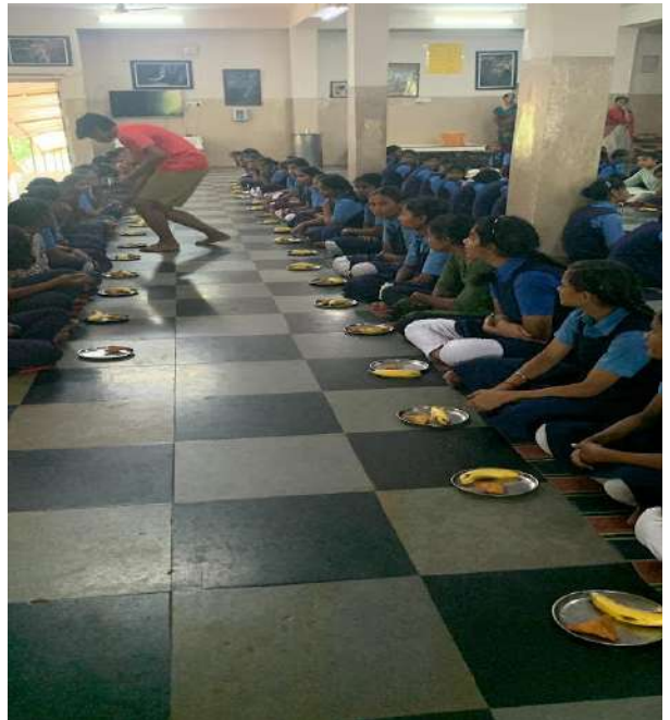
Volunteering at a welfare home