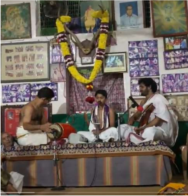
Carnatic Music Arangetram