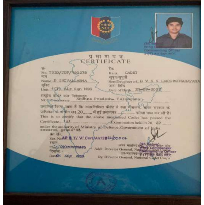
NCC A Certificate